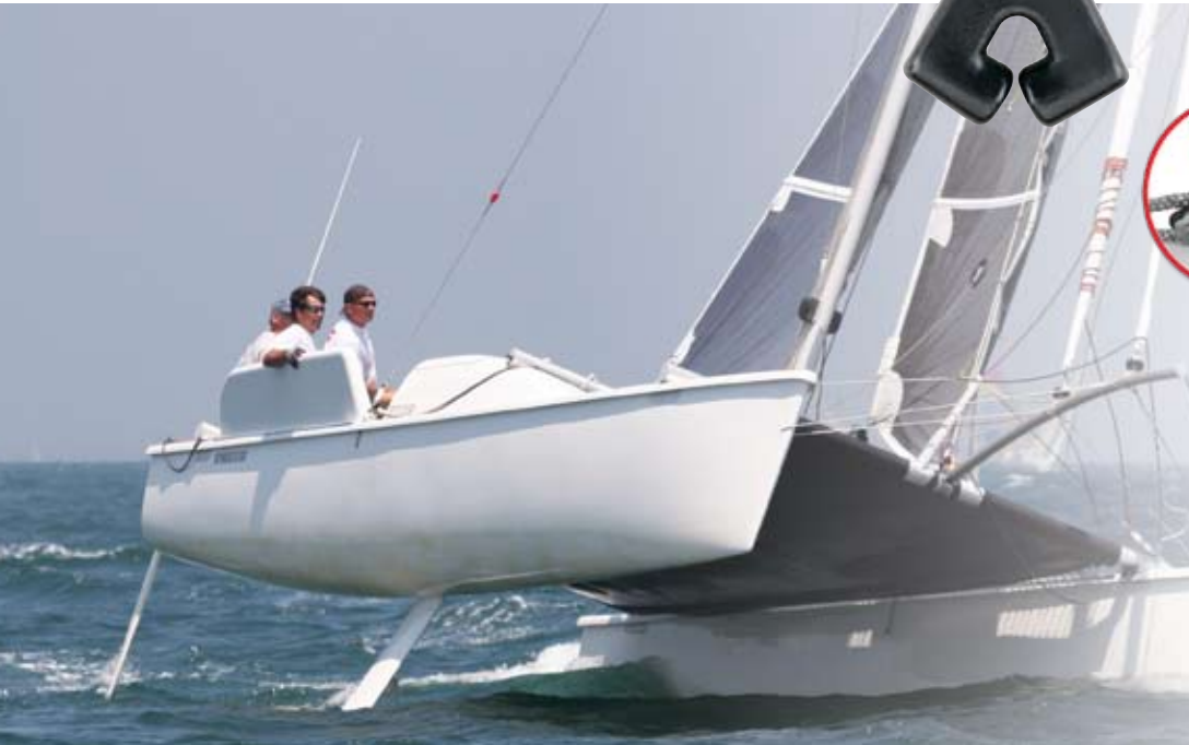
Reynolds 33