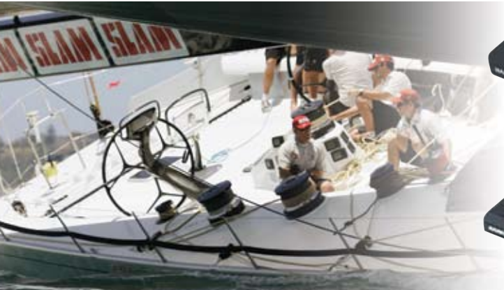
Alfa Romeo, 98 ft (30m) Super Maxi, Reichel/Pugh, McConaghy Boats