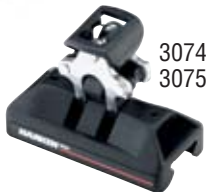
Captive rollers for easy loading and maintenance