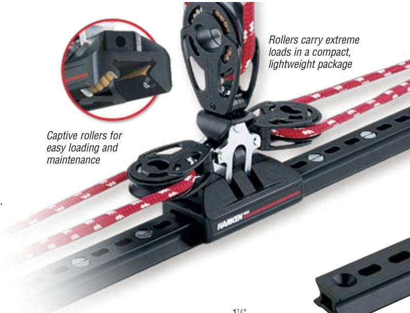
Rollers carry extreme loads in a compact, lightweight package

Consult chart on page 117 to size traveler to mainsail area.