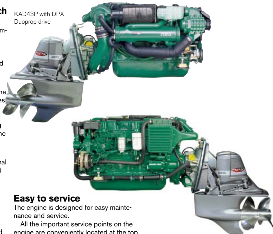
KAD43P with DPX Duoprop drive

The direct injection, supercharging and aftercooler contribute to minimizing noxious exhaust emissions and enhancing overall enjoyment of boating. The engine is certified according to SAV, IMO and IMO US/EPA.