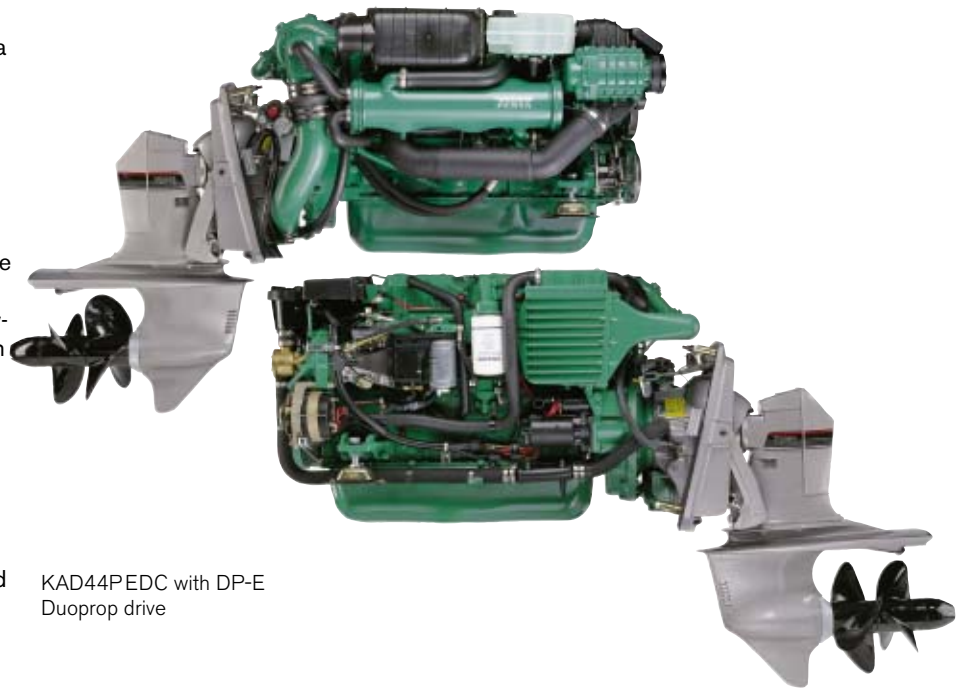
KAD44PEDC with DP-E Duoprop drive

The 4-valve technology and the advanced combustion system minimize noxious exhaust emissions and enhance overall enjoyment of boating. The engine is certified according to BSO II, SAV, IMO and IMO US/EPA.