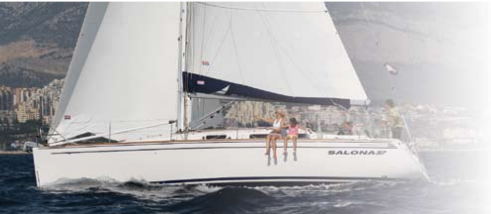
Salona 37, J & J Design, AD Boats