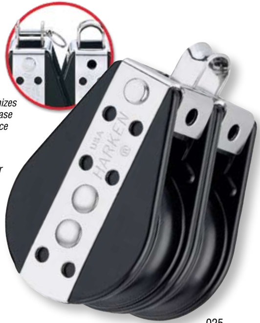
In-head shackle minimizes block length for purchase power in a limited space

Sheets Control lines Traveler controls Cunninghams